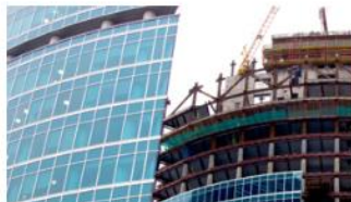
건축자재 및 감지, 방도 시스템