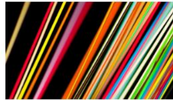
전선 및 케이블