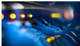
High Tech – 정보통신기기