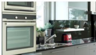
에너지 및 산업용 시스템