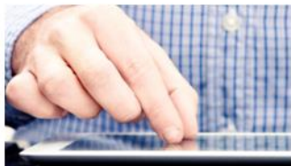
High Tech – 소비자전