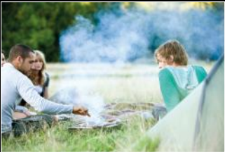
A group of young friends having a barbecue outdoors next to a tent

Each image in this collection is licensed and was approved via a human review system which controls for image quality and legal compliance. Images are 500px on the longest side with a single ground truth caption provided. All captions and keywords are in English and were moderated for hate speech, slurs, and expletives. This dataset contains a very broad set of concepts and scenarios (indoor and outdoor, with or without people, with or without animals).