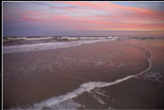
View from sandy beach of picturesque sunset horizon over sea surf lapping on shore