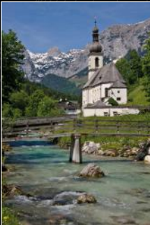
St. Sebastian's Church, Ramsau, near Berchtesgaden, Bavaria, Germany