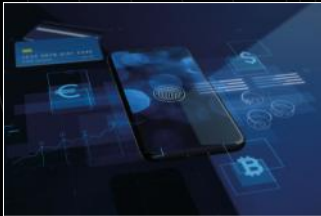
3D concept of online banking on mobile phone showing services currencies and graphs